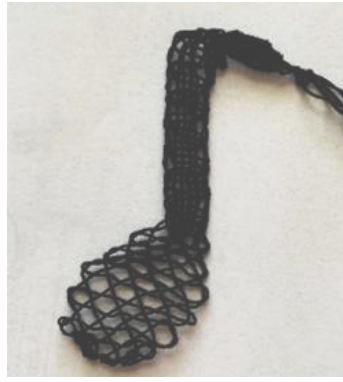
Above bobbin lace musical 8 th notes. To the right tatted musical 8 th notes.