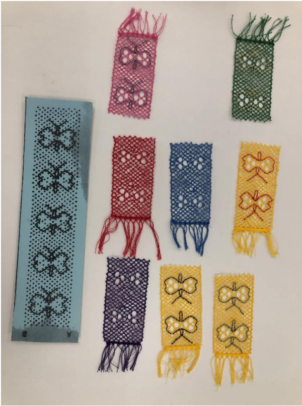
Julie's bobbin lace curtains for the buildings of a model train layout.