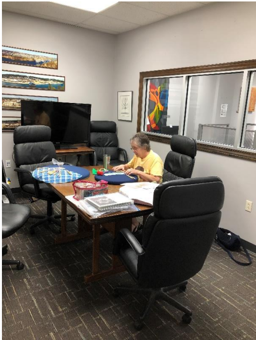
Show Me Lacemakers Newsletter