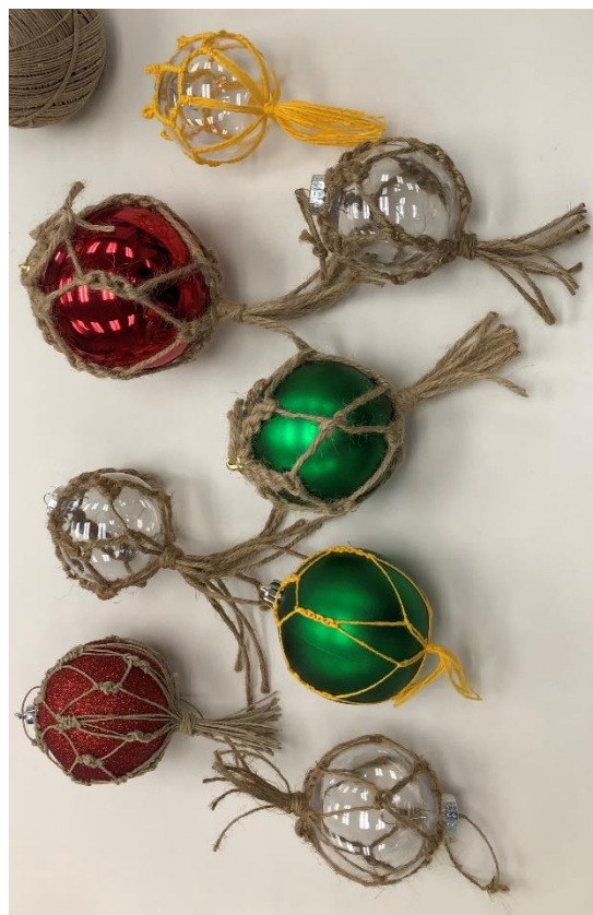
Carol working on a macramé cover for a Christmas ball. Test samples.