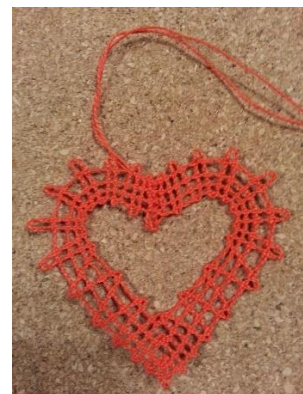
Shirley's "Circle of Hearts"